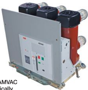
ABB's AMVAC magnetically actuated breaker