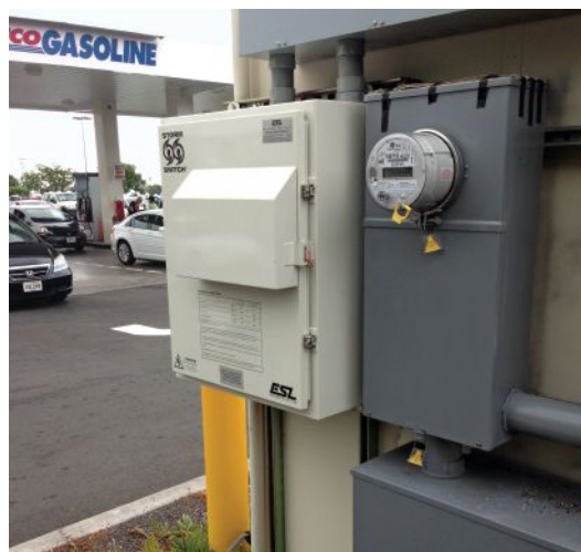
A manual transfer switch

ESL Power Systems focuses on a different angle of mobility—the