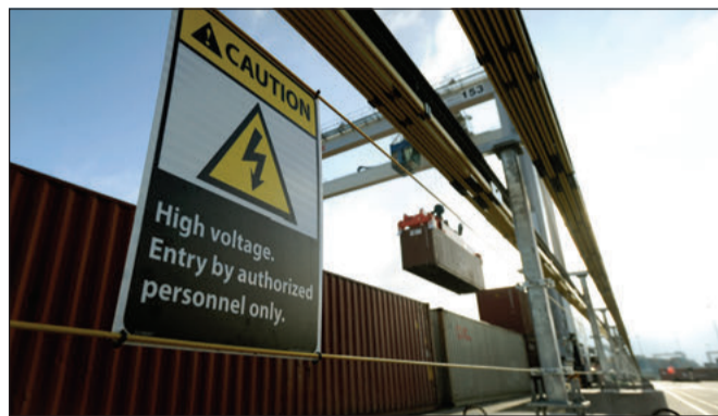
Set-up of the first installation in Savannah, using Conductix-Wampfler's Drive-in L system. Oversized concrete mountings were laid to protect the rail from vehicles

The United States now has four terminals running or installing electrically-powered RTGs and more look set to follow