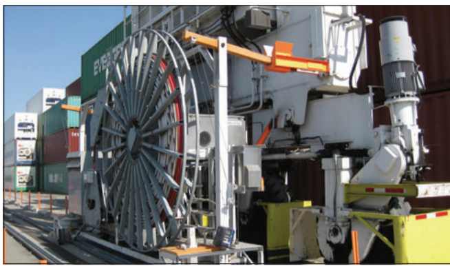
West Basin Container Terminal in the Port of Los Angeles is now running RTGs with the cable reel carrier system from Paceco Corp

The study could affect the sizing of conductor rails. The first four ERTGs are running on a